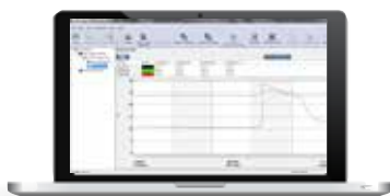
Data Logger Transfer Automatic report generation